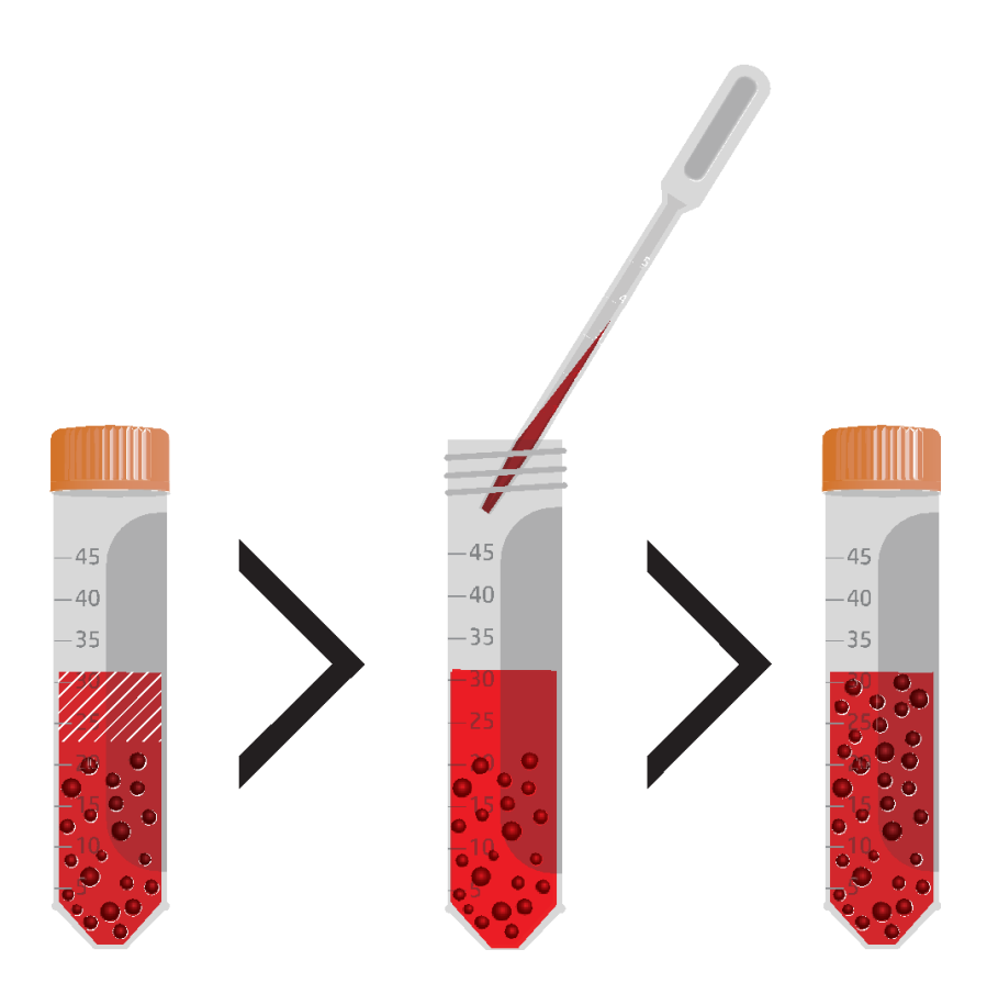
Figure 1. Media replacement using Happy Cell<sup>®</sup> ASM in either bioreactor tubes or microtiter plates.