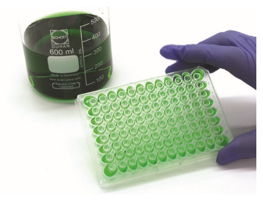
Figure 1 BioClime<sup>™</sup> 96 has anti spill properties

The BioClime<sup>™</sup> 96 has been created to provide a simple, effective 96-well microplate that saves time and money and improves the reproducibility of experiments.