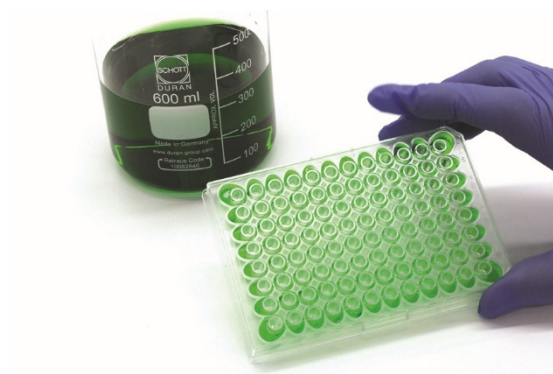
Figure 1 BioClime™ 96 has anti spill properties

The BioClime™ 96 has been created to provide a simple, effective 96-well microplate that saves time and money and improves the reproducibility of experiments.